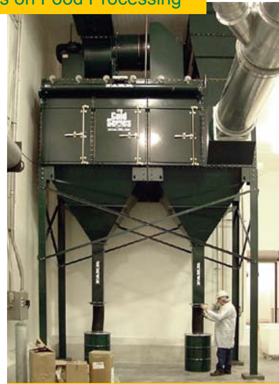
GS24 on Spice Dust Collection