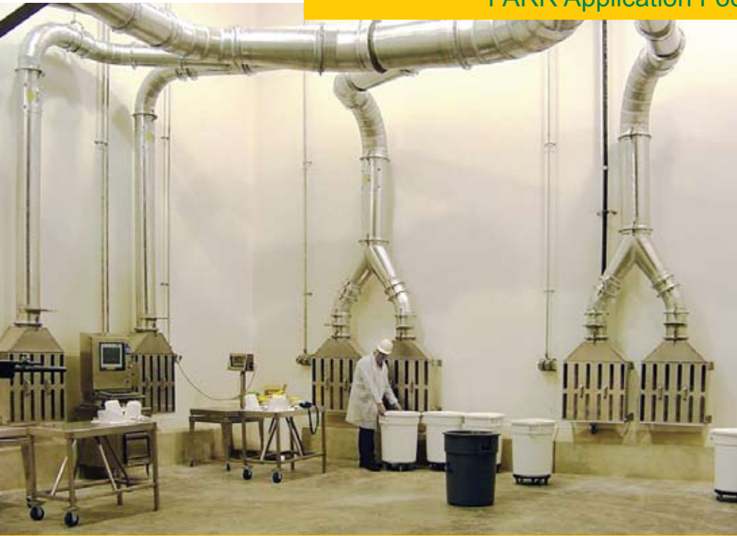
SS Side Draft Hoods for Spice Weighing