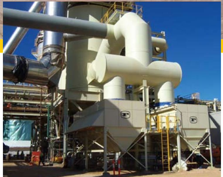
Two GS96's at a Nickel Mine

Controlling dust at excavation sites, mill transfer points and similar locations is a difficult challenge. The EPA has strict limits on annual emission amounts. If emissions are too high, production schedules may be curtailed. That's why proper design and selection of dust collection equipment is such an important concern. Minimizing emissions allows production of more product.