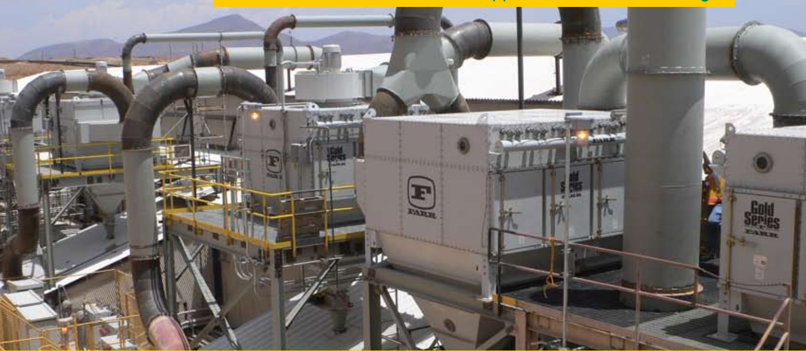
GS units on Crushing Copper Ore

Farr's innovative GOLD SERIES® collector is uniquely suited to the mining industry because of its extremely rugged heavy-gauge construction: It features a compact modular design that optimizes field flexibility and integrates well with conveyor bin vents.