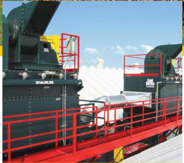
Two GS20's on Seed Cleaning

The Gold Series® dust collector can be used in a variety of Agricultural Seed Processing dust collection applications such as corn shellers, seed cleaning, seed preparation, seed coating, seed hybrid development and general facility ventilation. The vertical cartridge design works better and Farr APC is one of the few companies that can handle seed processing well.